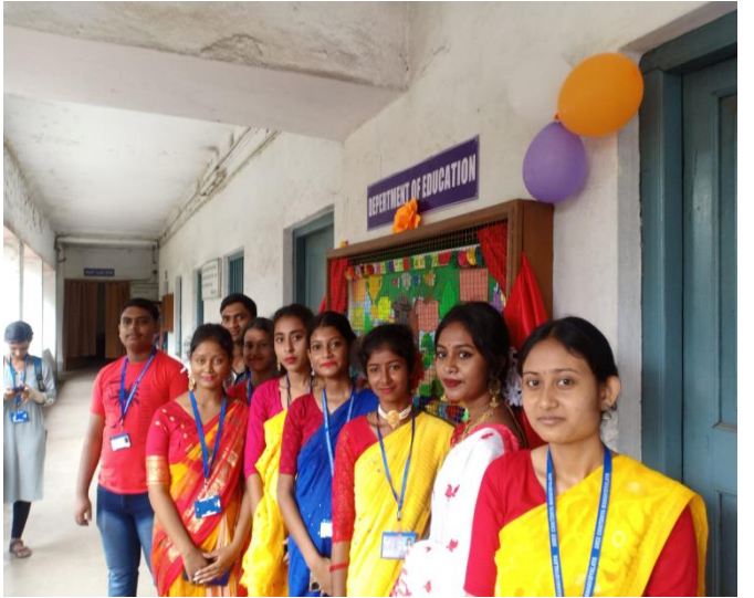
Annexure-I: Photocopy on Wall Magazine published

Any other information/report/remarks/comments: